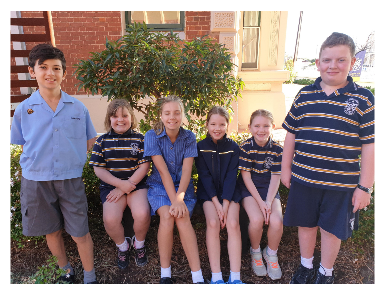
Family Faith Formation

As a school community, we pray for the following students in the Faith Formation Program who will prepare for and celebrate the